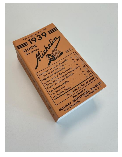
Facsimile republished by Michelin Editions